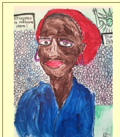
Original Painting by a Maplehill School Student

Each week, during the fourth quarter, Maplehill School students in the Small Group Program are developing their IT skills using Weebly blogs on the internet. Students are meeting with staff to develop blog posts documenting their projects, their learning and goals for their vocational classes. Students are learning how to upload photo images to their blogs and how to link their blogs to other related websites. Students are also learning how to personalize blogs with their own unique design flare, background