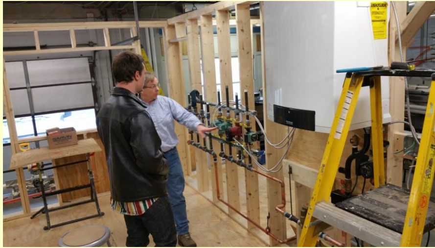
One Maplehill School student visited CCV Plumbing Department this spring to explore higher education in a trade skill.