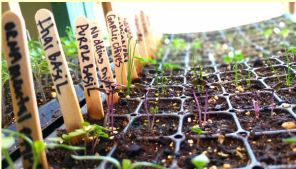
Little baby seedlings are growing in our greenhouse waiting for spring planting. We love springtime at Maplehill Community Farm.