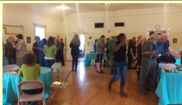
Maplehill School students, staff and community members enjoying the student art show on May 12 th

images, and audio clips. We are excited to help students find creative and innovative ways to document their learning and school work.